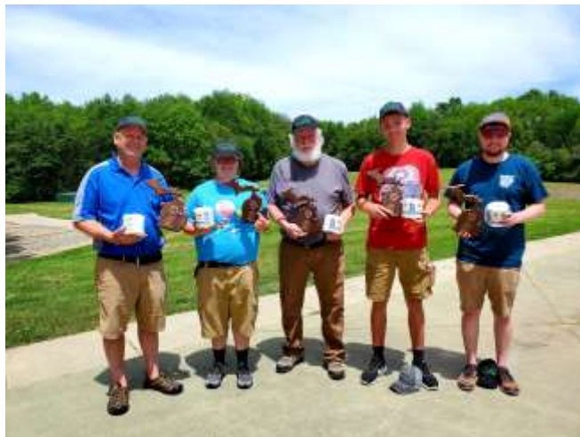
2020 Michigan Zone 6 Winners, June 2-day shoot at our Club

1 Trophy: Individual with the highest combined handicap score is our annual “HDC Champion”. Must shoot both Handicap Events 1 & 3 (200 targets).