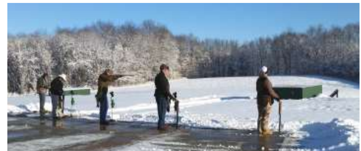
Such a pretty season for shooting when the sun’s out!

St Joseph County Conservation & Sportsman Club runs both Fall and Winter Trap “Money Leagues”. Fall runs Oct – Nov; Winter runs Jan – March. Concurrent BIG 50 Shoots may run during these leagues. Call 269-483-6803 for details & dates