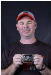
2021 CHAMPION Nevada State Handicap Championship

(4 classes) divided 60% - 40% in each class