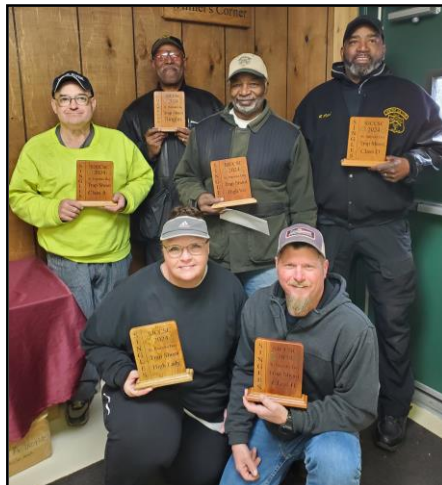
Group of some happy winners