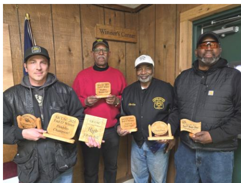
Group of some happy winners

*Our Club returned to ATA registered trapshooting in March 2007, after decades of the Club “not holding” ATA registered trap shoots. This year, 2026, marks 20 years of continuously holding ATA registered trap shoots at our club. We are very glad and honored that you are here to continue this tradition with us!