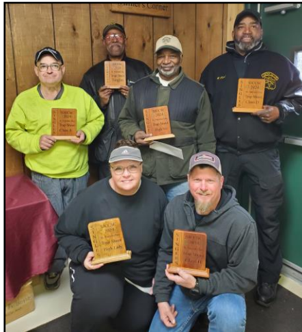
Group of some happy winners