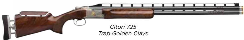
Citori 725 Trap Golden Clays